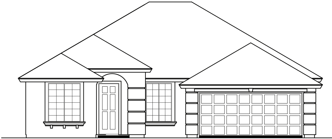
“A-2” ELEVATION-PLAN 1962